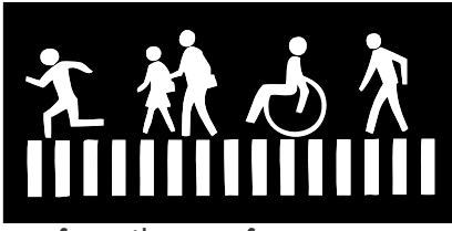
safe pathways for everyone